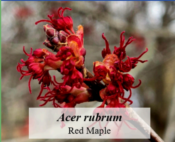
Acer rubrum Red Maple