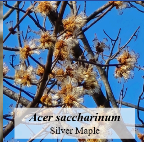
Acer saccharinum Silver Maple